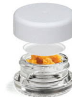
Stay-Clean Reusable White PET Disc

Child Resistant Caps: Smooth-Matte top & side Ribbed-Side, blank top